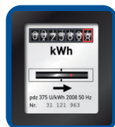
Existing Main Meter